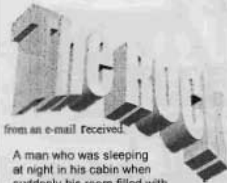
from an e-mail received.

A man who was sleeping at night in his cabin when suddenly his room filled with light and the Savior appeared. The Lord told the man he had work for him to do, and showed him a large rock in front of his cabin. The Lord explained that the man was to push against the rock with all his might. This the man did, day after day. For many years he toiled from sun up to sun down, his shoulders set squarely against the cold, massive surface of the unmoving rock, pushing with all his might. Each night the man returned to his cabin sore, and worn out, feeling that his whole day had been spent in vain.